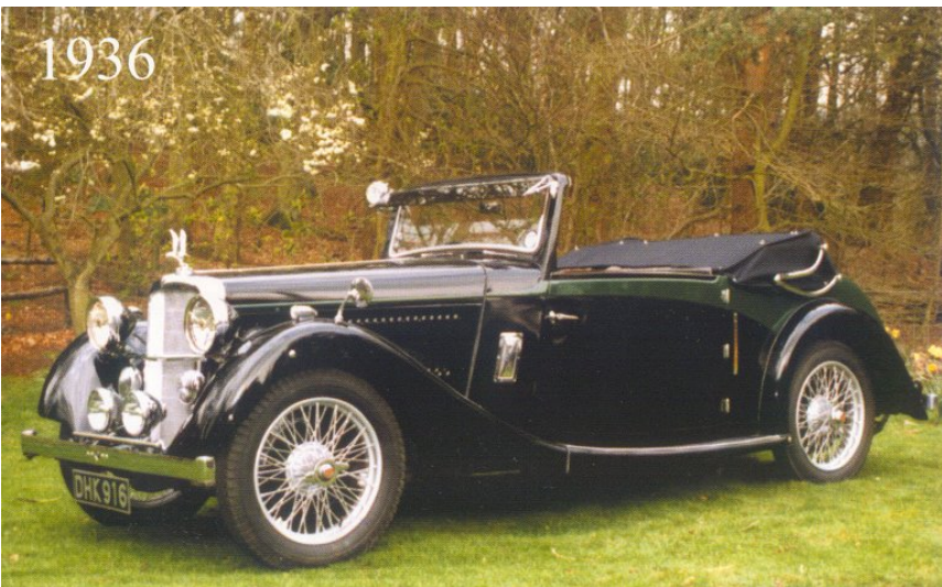
1936 Alvis Silver Eagle