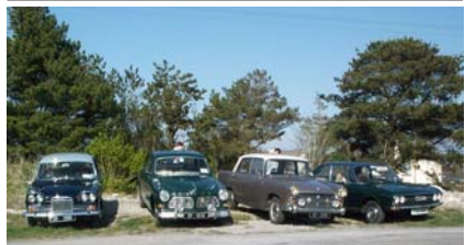
Some cars at Carraroe