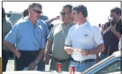
Selling Coke? Not really!