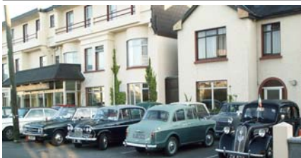
Some cars outside the Sacre Couer