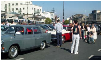
At the starting point in Salthill