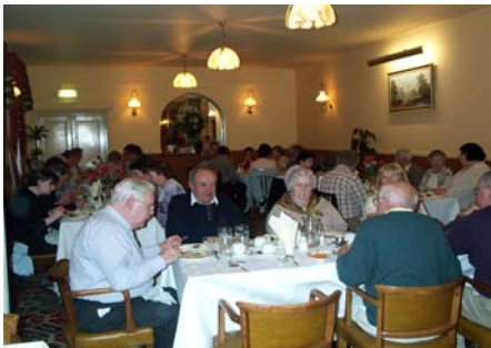
Enjoying the meal in the Sacre Couer Hotel

This Year's "Meals after Wheels" was a tremendous success. On a day of glorious sunshine and with over forty cars and almost seventy people this "run" took off from the promenade carpark in Salthill shortly after 2.00pm on Sunday, April 6th. After a rendezvous outside the Connemara Coast Hotel and another "progress review" near TG4, the soup and sandwiches at Óstán an Cheathrú were very welcome. The return journey was through Maam Cross and Oughterard and back to the Sacre Couer Hotel for an excellent evening