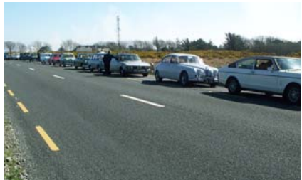
Consolidation point outside TG4